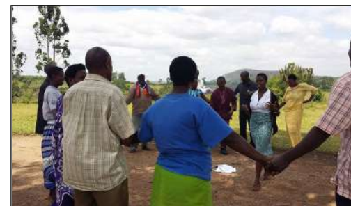
FIS staff facilitate a community training activity