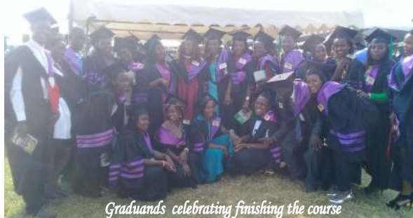
Graduands celebrating finishing the course

The overall goal of this programme is to train specialists in gender and women health issues. The gender and women health programme is an interdisciplinary disciplinary course that exposes students to a wide range of content that is cross-listed and contains courses that address feminists, women health and gender issues. Within this programme students are given theoretical and practical understanding of the interrelationship between gender, culture, biomedical and psychosocial factors that influence women health and illness.